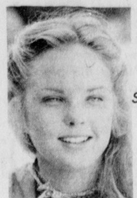
Melissa Sue Anderson

Missy, a straight-A student, whose previous acting experience has been ten commercials and a featured spot on "The Brady Bunch," reports her sole source of career motivation comes from herself. And though her mother is beside her every day, "It's my responsibility to do my job. If I want to continue acting, I have to work at it myself. I'm lucky to have a steady job and the good experience of a series. But it's my own thing."